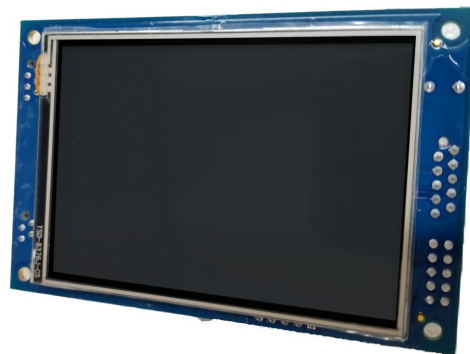
EA-0008-04 Display Board