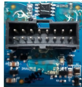
EA-0004-04 Brew Head Power Board